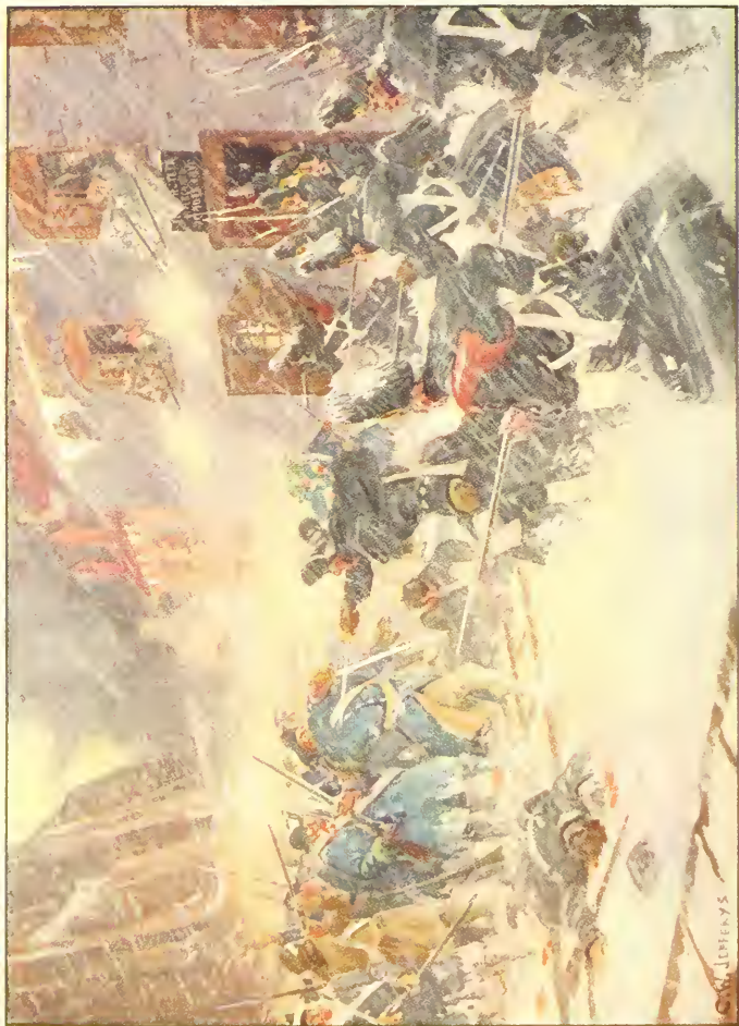
THE FIGHT AT THE SAULT-AU-MATELOT